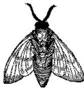
Figure 3. A sample black and white graphic that has been resized with the includegraphics command.