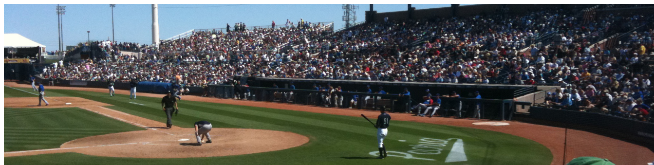
Figure 1. This is a teaser