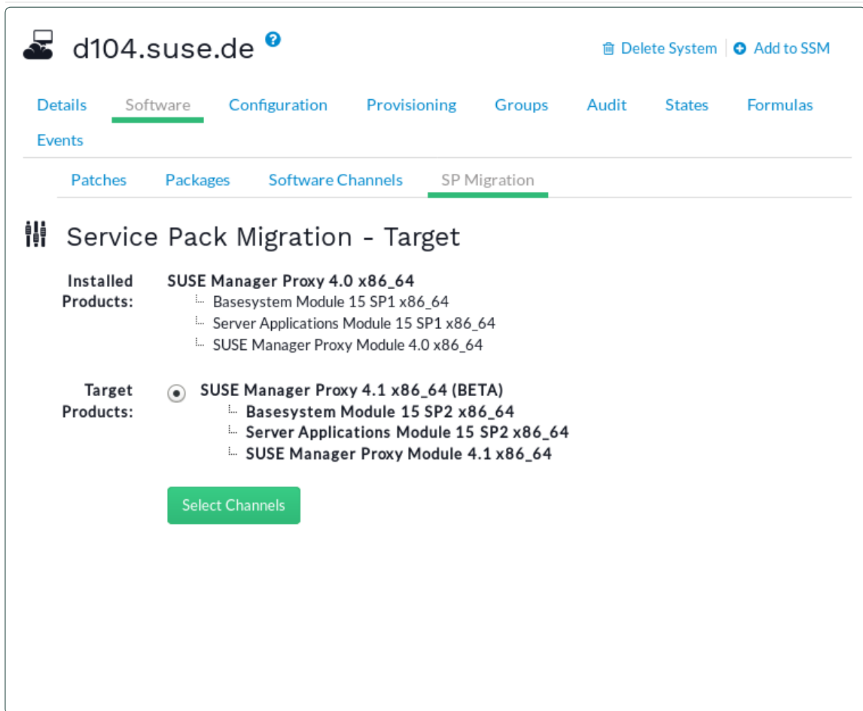
Figure 1. Proxy SP Migration (Target)