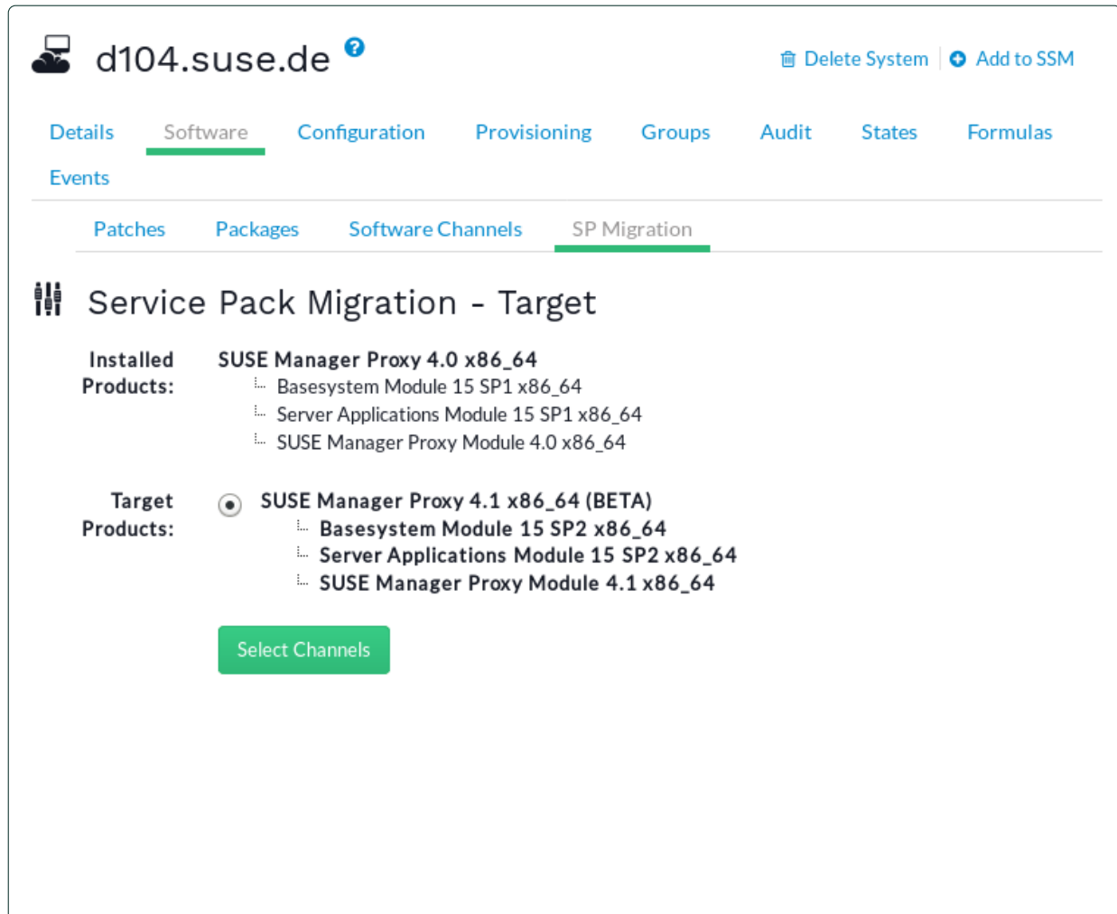
Figure 1. Proxy Product Migration (Target)

To update a proxy use the Product Migration :