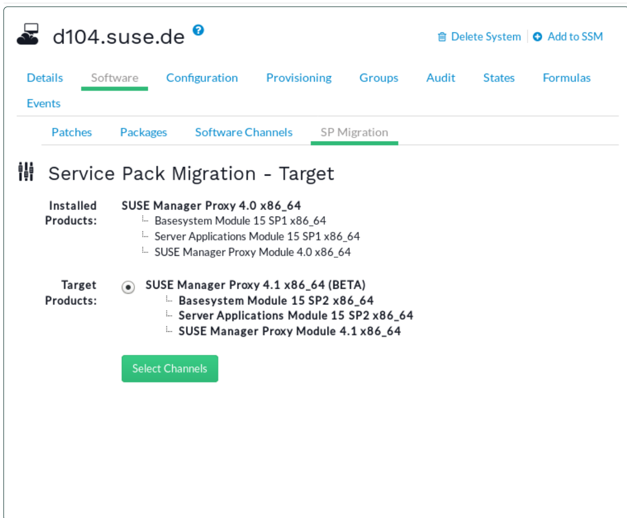
Figure 1. Proxy SP Migration (Target)