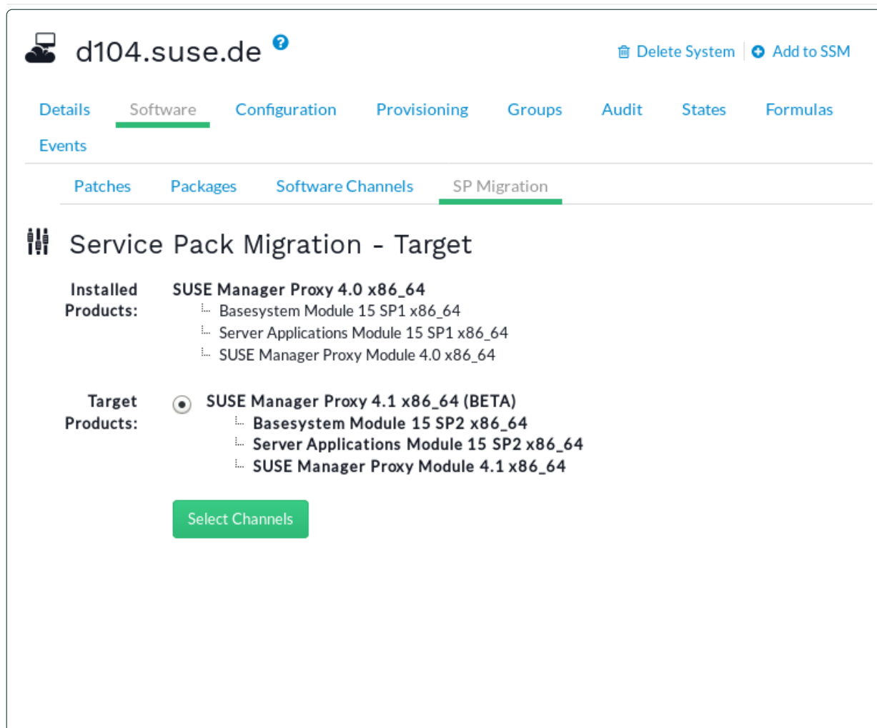
Figure 1. Proxy SP Migration (Target)